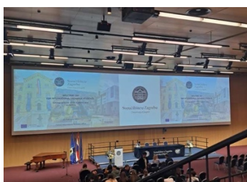
Awarding ceremony on the occasion of the 150th anniversary of the faculty