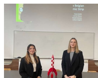
Lecture on the history of Belgian comic strip